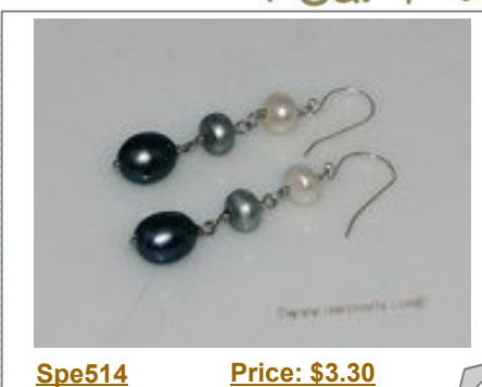
White & Grey Button Pearl and 8-9mm Rice Pearl Dangling Earrings

Charming cultured pearl Elastic bracelet, featured of 8-9mm white freshwater potato pearl decorated with an 15*40mm cross fittings! this Stretchy bracelet measures 7.5 inches and strung on stretch-cord to fit any size wrists!