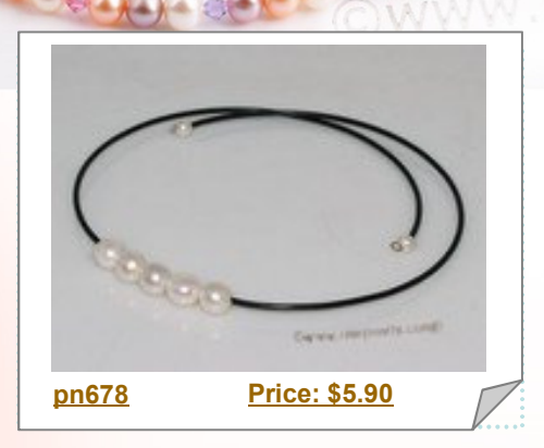
large 10-11mm white potato pearl black rubber corde necklace

10-11mm white large frehwater potato pearl threaded in the center of the black rubber corde necklace, two little 5-6mm white potato pearl as decoration in the end, 22inch in length and not include clasp