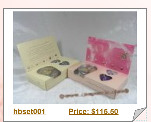
50pcs(one carton) freshwater wish pearl gift set with earings&ring

10-11mm white large frehwater potato pearl threaded in the center of the black rubber corde necklace, two little 5-6mm white potato pearl as decoration in the end, 22inch in length and not include clasp