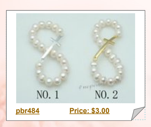
Fashion Freshwater Pearls Cross Elastic Bracelet Bangle

This pearl bracelet incorporates 5-6mm white potato freshwater pearls and sterling silver fittings, secured with a sterling silver lobster clasp