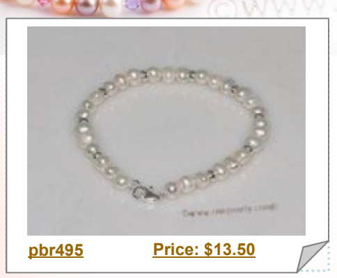
5-6mm white potato pearl bracelet with 925 silver fitting and clasp

This pearl bracelet incorporates 5-6mm white potato freshwater pearls and sterling silver fittings, secured with a sterling silver lobster clasp