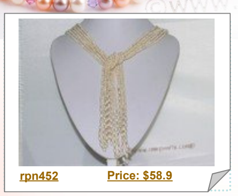
Six Strand freshwater seed pearl Long Style scarf Necklace

The Six loose strand necklace are hand strung with tiny 3-4mm button seed pearls, end with 5-6mm rice pearl tassels and silver tone fitting