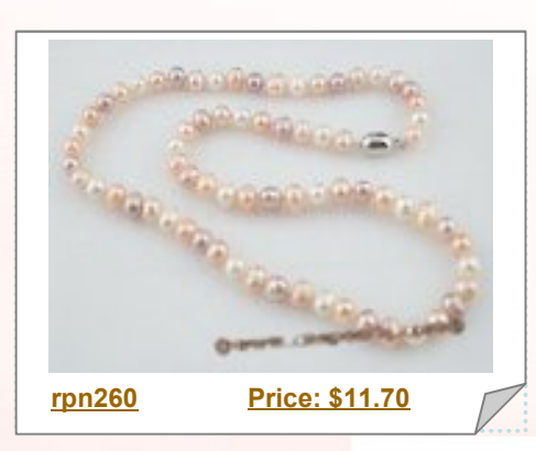
Smart 24inch 8-9mm mixcolor potato pearl Matinee Necklace

Designer freshwater pearl dangle earrings, handcrafted of 7-8mm white and grey button pearl, 8-9mm black rice pearl; These gorgeous pearl dangle earrings combine with sterling silver ear hook