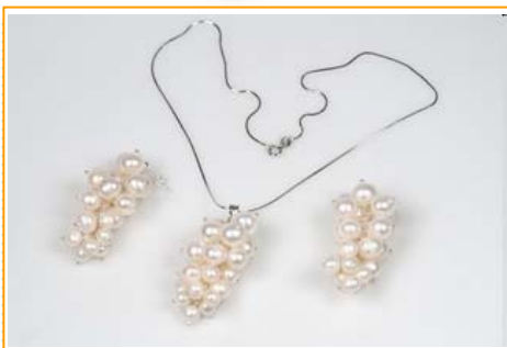
pnset572 Price: $35.60