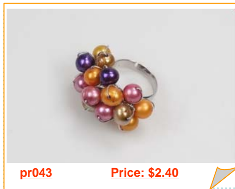
Handcraft Colorful Potato pearl Silver toned Adjustable Ring

This is a Brand New Sterling Silver Ring with one piece 7-7.5mm akoya pearl, perfectly round, AA grade, High luster, Light blemishes in the surface. US SIZE 7