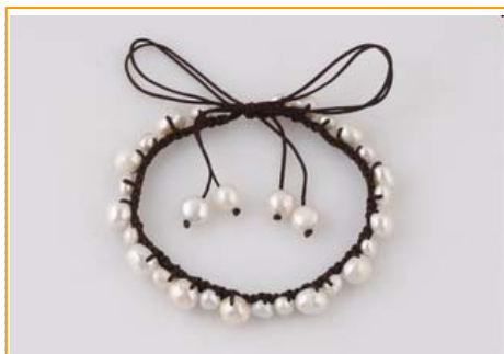
pbr381 Price: $3.30

A beautiful array of glamorous pearls decorates this bracelet, the bracelet features 4-5mm and 7-8mm pink color freshwater nugget pearl