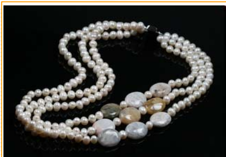
mpn327 Price: $26.40