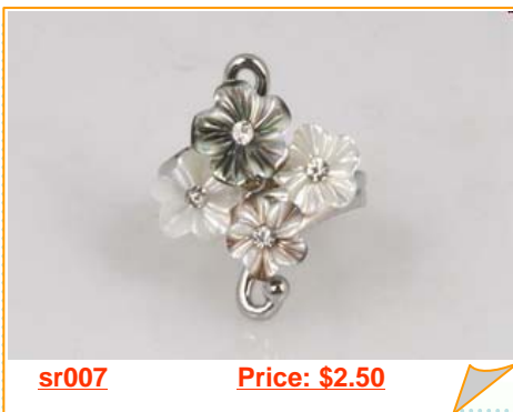
Silver-toned Carve Flower Sea Shell Adjustable Ring

A charming genuine 4mm red round coral beads ring with adjustable 18KGP mounting, ring is made with an expandable open back band for a "one size fits most