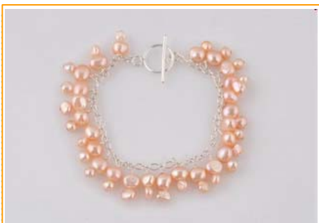
pbr379 Price: $14.20

Wear this fun and flexible bracelet for every occasion! This gorgeous cultured pearl bracelet is created from 4-5mm white and black color freshwater potato pearl