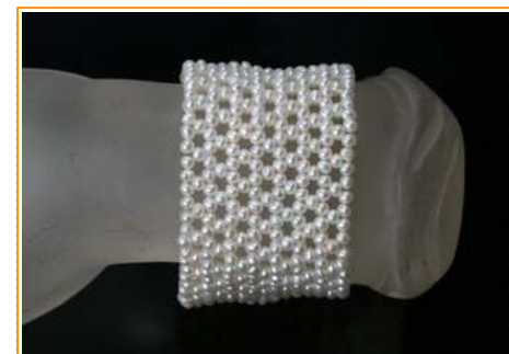
pbr377 Price: $17.60

This beauty pearl bracelet hand knitted by black thread with white 4-5mm alternated with 7-8mm freshwater nugget pearls