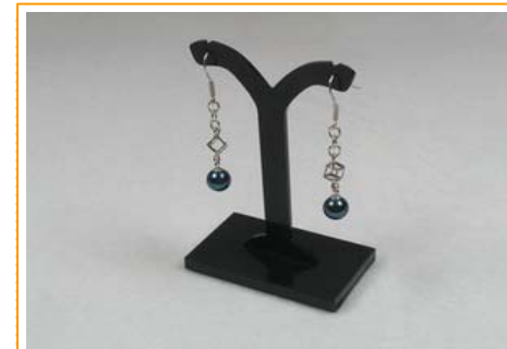
ape005 Price: $22.50

Value and elegance! This Smart rice pearl bracelet hand strung the 4-5mm white freshwater rice pearl into freshwater pearl ball, alter with 925 silver fitting