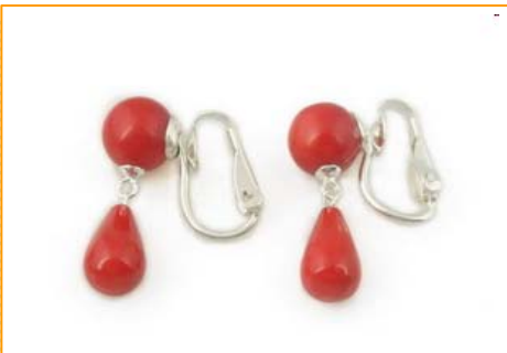
ce031 Price: $10.40

stunning akoya pearl dangles earring feature Beautiful 7-7.5mm black akoya pearls hang on a chain for added swing while dancing