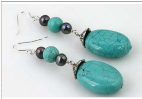
tqe011 Price: $3.80

sterling coral earrings made of 8mm red round coral beads and 7*15mm teardrop coral beads, with 925silver clip