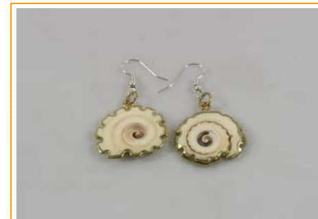
se056 Price: $1.50

Such a great combination, 18*27mm oval turquoise and 6-7mm black potato pearl. This pierced dangle earrings with 925silver hook are destined to be in your jewelry box