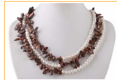
mpn333 Price: $10.40

Designer freshwater pearl Layer necklace, Hand knotted with white silk thread, made of 6-7mm potato shape freshwater pearl, 9-10mm Rice shape pearl Combine 6mm blue turquoise beads