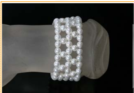
pbr376 Price: $8.20