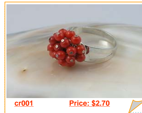
5mm round red coral ring with adjustable 18KGP mounting

A charming genuine 6-7mm multi-color potato shape freshwater pearl Ring with adjustable silver toned fittings, ring is made with an expandable open back band for a "one size fits most