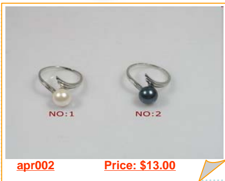
sterling silver 7-7.5mm saltwater pearl ring, US SIZE 7

This is a Brand New Sterling Silver Ring with one piece 7-7.5mm akoya pearl, perfectly round, AA grade, High luster, Light blemishes in the surface. US SIZE 7