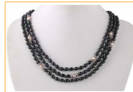
mpn328 Price: $11.80

Designer Four-strands pearl necklace has a substantial feel and a beautiful 4-5mm light peacock black freshwater rice shape pearl, arranged with 10*20mm Hematite beads to created this elegant look