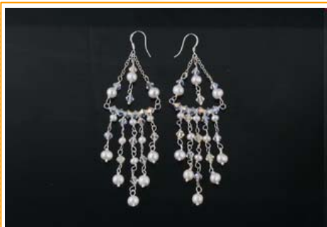
spe419 Price: $12.70