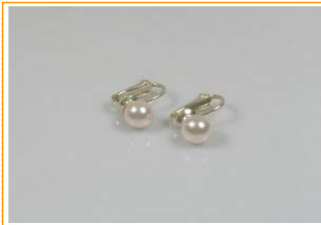
ape008 Price: $28.40

Dazzling Sterling Silver pierce hook Chandelier dangle earrings, Drop with four strands 3-4mm and 5-6mm white color freshwater potato pearl