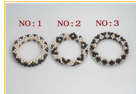
pbr378 Price: $10.40

This beauty and purity pearl bracelet enhance cereal's feminine design. we hand crafts this gossamer bracelet by white 4-5mm mix 6-7mm freshwater potato pearls