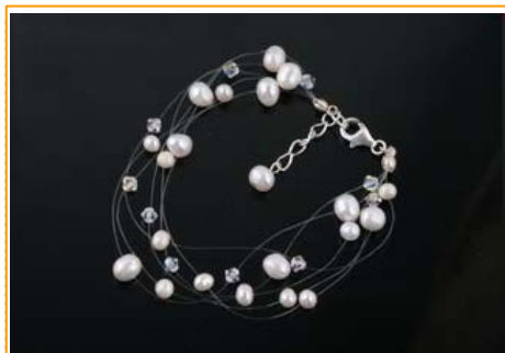
pbr380 Price: $5.90

Dazzling cultured Pearl elastic bracelet knitted by elastic colloid wire with 6mm white round shell pearl beads! 7.5 inch in length and without clasp