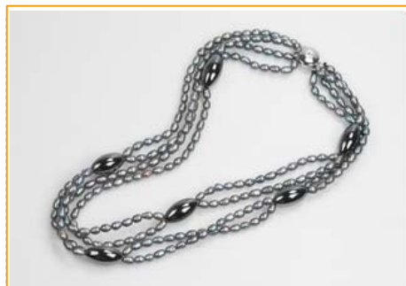
mpn330 Price: $19.90

Designer freshwater pearl Layer necklace, Hand knotted with white silk thread, made of 6-7mm potato shape freshwater pearl, Combine 15*20mm mass agate beads