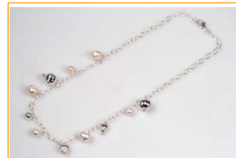
pnset581 Price: $24.90

Hand-knotted 16-inch pearl necklace and 7.5-inch bracelet jewelry set, Hand-selected with 4-5mm white color side drilled seed pearl strung by white thread for durability