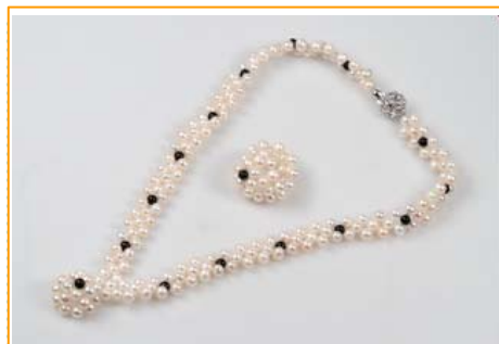
pnset578 Price: $15.00

Designer Grape pendant necklace Jewelry set include an pendant and an pair of stud earrings; This jewelry set hand wrapped with 10mm, 8mm and 6mm Freshwater potato pearl