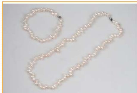
pnset579 Price: $6.20

This specially design cultured Pearl necklace hand crafted 8-9mm white color freshwater potato pearl alternated with 5*12mm oval sterling silver findings