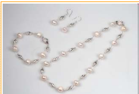
pnset580 Price: $22.80

Designer Grape pendant necklace Jewelry set include an pendant and an pair of stud earrings; This jewelry set hand wrapped with 10mm, 8mm and 6mm Freshwater potato pearl