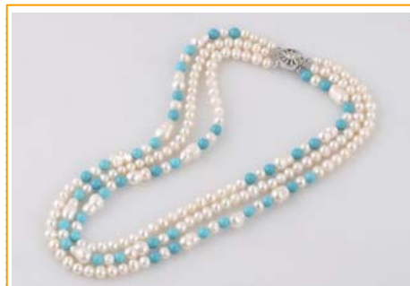
mpn332 Price: $19.90

This Fashion double-strands pearl necklace has a substantial feel and a beautiful blend of colors. White, Purple, and green freshwater potato shape pearls