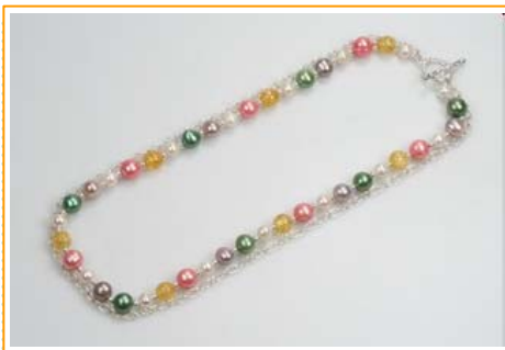
mpn329 Price: $33.60

This Fashion three-strands pearl necklace has a delicate look and featured 5-6mm black freshwater rice shape pearl, accentuate with the 6-7mm purple nugget pearl, decorated with silver toned spacer fitting