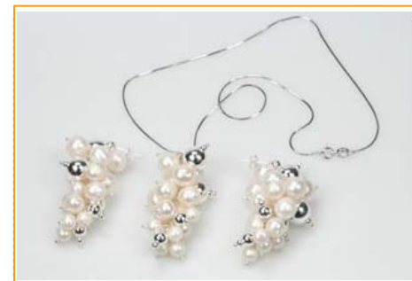
pnset573 Price: $47.70

Timeless black agate and Pearl necklace crafted by hand with 4-5mm white potato pearl, decorated with 4mm round black agate beads; It can be worn at necklace 16inch