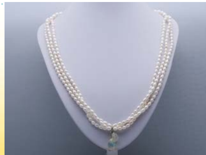
Rpn443 Price: $21.90

Cascading from this white 8-9mm freshwater potato pearl princess necklace, decorated with 8mm faceted crystal, 20mm white gemstone and 15*18mm jade beads,