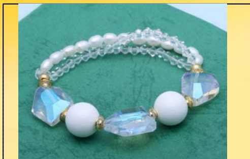
Pbr482 Price: $5.90

lovely bangle bracelet, featured of 9*12mm blue and 7*13mm white color drop shape crystal beads thread in a flexible lariat wire to fit your own wrist size. decorated with silver toned pipe.