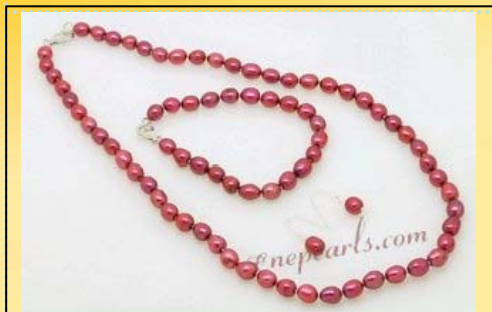
pnset633 Price: $16.20

Fashion necklace jewelry set hand wired by silver plated copper wire with 6-7mm white potato shape freshwater pearl, centered with 18*12mm round shape grade A jadeite jade beads,