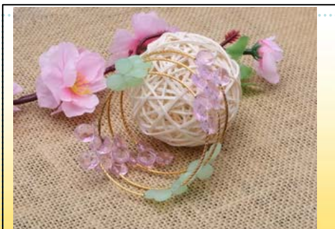
Crbr047 Price: $2.60

The fashion and turn of lovely colorful 9*12mm faceted man made crystal thread in a flexible lariat wire to fit your own wrist size. decorated with gold toned pipe.