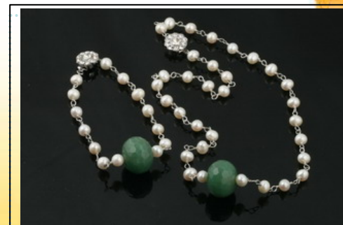
pnset472 Price: $5.50

Enticing shimmer of pearls makes for a flattering look when you wear this necklace and earrings jewelry set, Mounted on fine sterling silver, 7-8mm freshwater round pearls provide an enticing shimmer that draw eyes and set this accessory a pear.