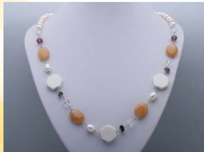
Pn653 Price: $7.90

With fall and winter coming, perhaps your jewelry needs a bit of updating? Well, here are a few 2013 fall and winter fashion jewelry that you want to consider purchasing!