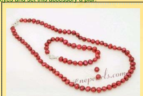
pnset632 Price: $11.6

Hand-knotted 16-inch cultured pearl necklace and 7.5-inch pearl bracelet are made with exquisite, Hand-selected with 7-8mm wine red color freshwater rice shape pearl strung by white thread