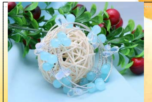
Crbr046 Price: $5.60

lovely bangle bracelet made of colorful 9*12mm faceted man made crystal thread in a flexible lariat wire to fit your own wrist size. decorated with gold toned pipe.