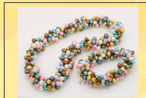
pnset634 Price: $16.80

Hand-knotted 16-inch nugget pearl necklace and 7.5-inch nugget pearl bracelet are made with exquisite, Hand-selected with 7-8mm wine red color freshwater nugget pearl strung by white thread