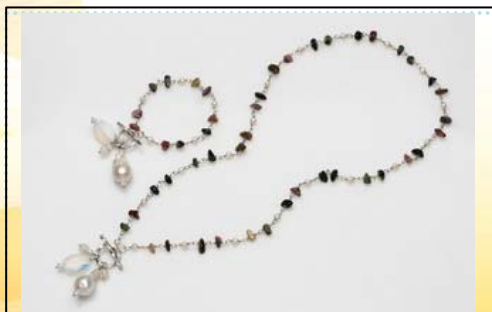
pnset650 Price: $21.80

With fall and winter coming, perhaps your jewelry needs a bit of updating? Well, here are a few 2013 fall and winter fashion jewelry that you want to consider purchasing!