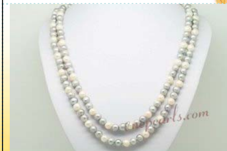
Rpn419 Price: $16.40

Designer hand strung layer necklace! Very elegant necklace that is made with 6-7mm freshwater rice shape pearl, combine with three layer rows 4-5mm rice shape pearl. decorated with drop crystal.