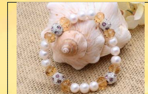
pbr476 Price: $6.30

Gold tone link necklace with cluster of white 5-6mm pearls in rice shape and 14mm round agate beads, 16mm gold toned crystal beads and cord