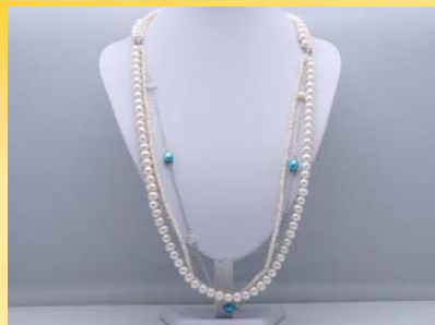
Rpn446 Price: $23.60

Fashion pearl rope necklace hand knotted with silk thread, 8-9mm white and grey color Low quality cultured freshwater potato pearl