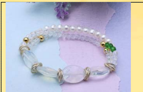
Pbr490 Price: $6.20

Enhanced Freshwater seed Pearl and crystal Stretch Bracelet, featured of one row 4-5mm rice shape seed pearl and two rows 4mm faceted crystal, Decorated with 16*20mm crystal