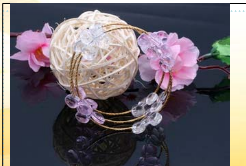
Crbr045 Price: $2.60

With fall and winter coming, perhaps your jewelry needs a bit of updating? Well, here are a few 2013 fall and winter fashion jewelry that you want to consider purchasing!