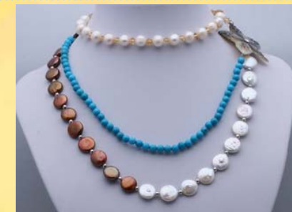
Rpn445 Price: $24.90

Fabulous cultured pearl opera Necklace, mixed with 4-5mm white freshwater potato pearl, 11-13mm and 16-17mm coin pearl, combine with an 13*22mm shell beads & 8mm faceted crystal beads