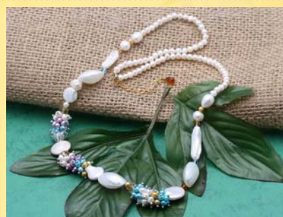
Rpn444 Price: $21.80

Elegant three rows opera necklace! Very elegant necklace consist of one row pearl 8-9mm potato pearl, one row 4-5mm freshwater button pearl and one row 8-9mm blue nugget pearl with silver toned rolo chain.