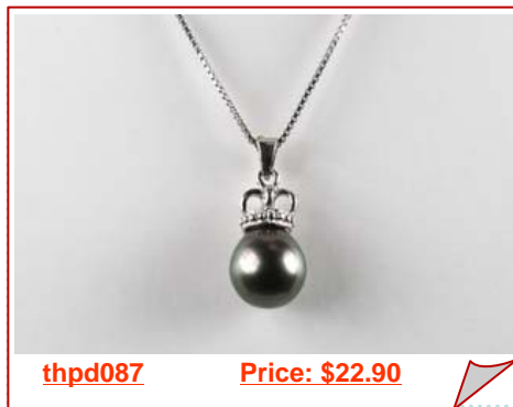
9-10mm A Grade Baroque Tahitian Pendant in Sterling Silver

Perfect for everyday wear, each 9.0-10.0mm, A quality black Circle' semi-baroque Tahitian pearl is hand selected for it's smooth surface, good luster and light Circled blemishes on the top