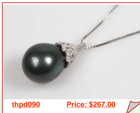
Classic Sterling Silver 14-15mm AAA Grade Baroque Tahitian Pendant

Perfect for everyday wear, Sterling silver Circle Semi-baroque tahitian pearl pendant(9.0-10.0mm, A quality) is hand selected for it's smooth surface, good luster and light Circled blemishes on the top