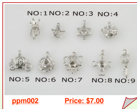
Ten pieces Silver plated copper wish pearl pendant&cages

Wholesales 925 Silver wish pearl pendants, love pearl cages, can combine them with oyster pearls in cans to make wish pearl necklace jewelry set