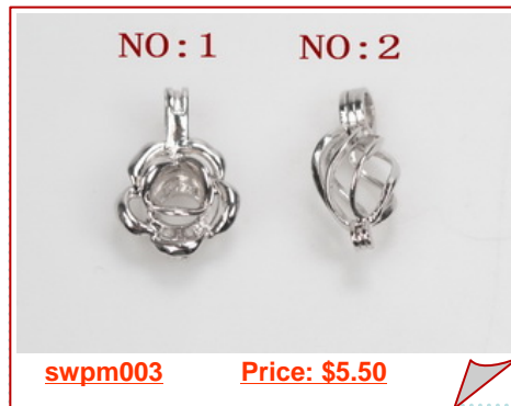
Sterling Silver Wish Pearl Cage Pendants in Flower Design

Wholesales Sterling Silver wish pearl pendants, love pearl cages, can combine them with oyster pearls in cans to make wish pearl necklace jewelry set