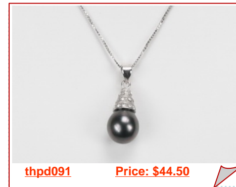
Fashion Semi-baroque Black Tahitian Pearl Pendant,11-12mm, A quality

Fashion Sterling silver Semi-baroque black tahitian pearl pendant,13-14mm, A quality, hand selected for it's smooth surface, good luster and light Circled blemishes on the top