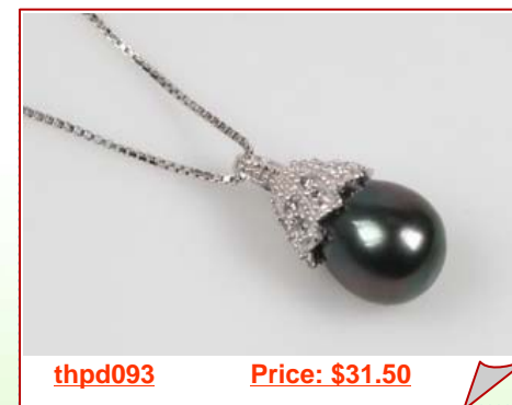
Sterling silver Semi-baroque Black Tahitian Pearl Pendant, 10-11mm, A quality

Classic Sterling silver Semi-baroque black tahitian pearl pendant(14-15mm, AAA quality) is hand selected for it's smooth surface, high luster and light Circled blemishes on the top