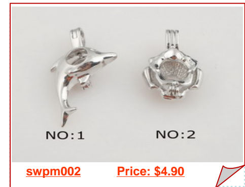
925silver Wish pearl pendants (cages) in flower or dolphin design

Wholesales Sterling Silver wish pearl pendants, love pearl cages, can combine them with oyster pearls in cans to make wish pearl necklace jewelry set.