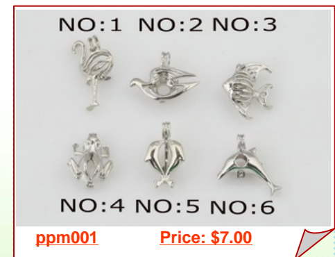
wholesale ten pieces silver plated copper wish pearl pendant&cages

Wholesales silver toned copper wish pearl cages in hand design, love pearl cages, can combine them with oyster pearls to make wish pearl necklace jewelry set