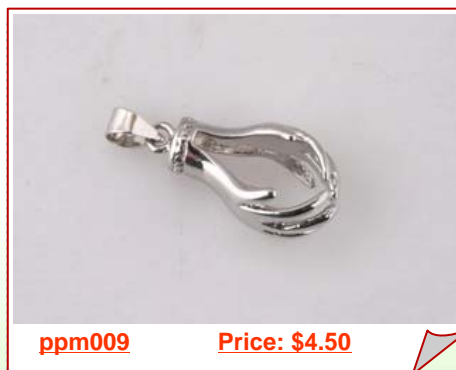
Ten pieces Silver Toned Hand Design Cage Pendant

Wholesales silver plated copper wish pearl cages in different style, love pearl cages, can combine them with oyster pearls to make wish pearl pendant necklace jewelry set