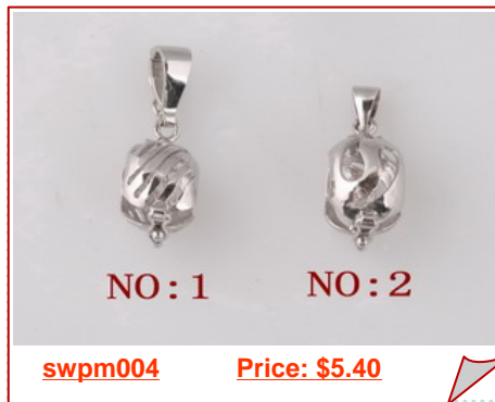
Wholesale Sterling Silver Wish Pearl Cage Pendants

Wholesales Sterling Silver wish pearl pendants, love pearl cages, can combine them with oyster pearls in cans to make wish pearl necklace jewelry set