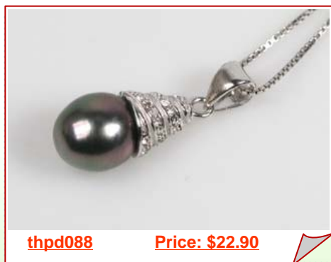
Circle' semi-baroque Tahitian Sterling Silver Pendant,9-10mm, A quality

Fashion Sterling silver Semi-baroque black tahitian pearl pendant,11-12mm, A quality, hand selected for it's smooth surface, good luster and light Circled blemishes on the top