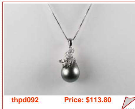
Design 13-14mm Semi-baroque Black Tahitian Pearl 925silver Pendant, A quality

Perfect for everyday wear, each 9.0-10.0mm, A quality black Circle' semi-baroque Tahitian pearl is hand selected for it's smooth surface, good luster and light Circled blemishes on the top