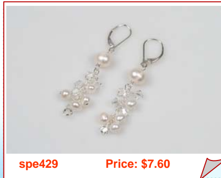
Delightful 925Silver Cultured pearl & Crystal Pierce Earrings

Beautiful pearl dangle earrings add pizzazz to any outfit, hand-crafted, 7-8mm freshwater potato pearl swing on sterling silver role chain