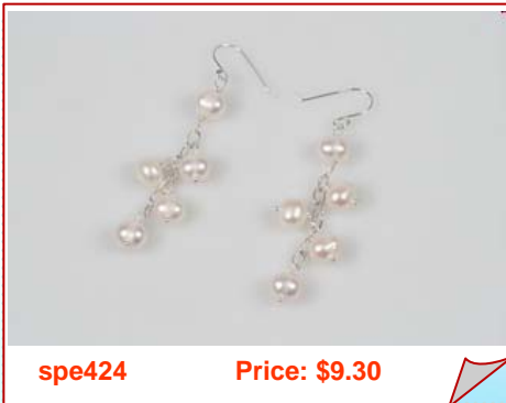
Hand Crafted Sterling Silver Cultured pearl Pierce Earrings

Delightful cultured pearl stud earrings, hand-crafted of 6mm white & champagne color shell pearl, 4-5mm white potato pearl and 4mm crystal beads swing on sterling silver role chain