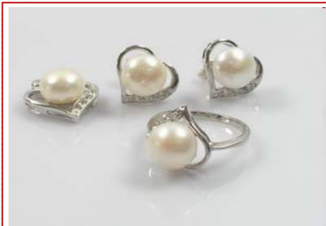
pnset098 Price: $22.50

Wholesale twisted Pearl necklace featured of two rows 6-7mm white color side drilled pearl alternated with 10-11mm green keshi pearl