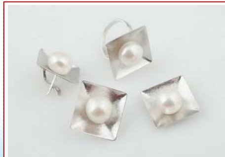
pnset398 Price: $28.20

Sterling pearl jewelry set featured 9-9.5mm white bread pearl combine with sterling silver peach-design mounting with zircon beads; Different pearl color for you