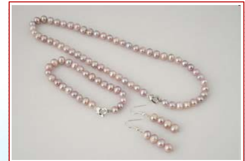
pnset263 Price: $8.80

Elegant sterling silver pearl jewelry set consist of white color 9.5-10mm freshwater bread pearl combine with 925silver square mounting