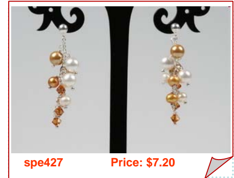
Elegant Pearl & Crystal 925Silver Stud Pierce Earrings

This stunningly elegant cultured pearl dangle earrings, hand wired by sterling silver line, made of 5-6mm red potato pearl combine with an 12-13mm white coin pearl