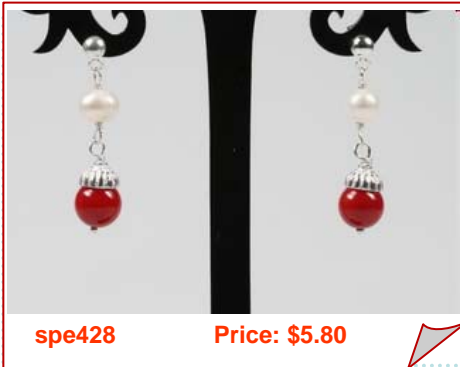
Latest Cultured Pearl & Coral Pierce Earrings in Sterling Silver

This stunningly elegant cultured pearl Coral stud earrings, hand wired by sterling silver line, made of 7-8mm white potato pearl and 10mm red coral beads