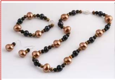
pnset596 Price: $38.00

Fashion hand knotted cultured freshwater pearl shell pearl jewelry set