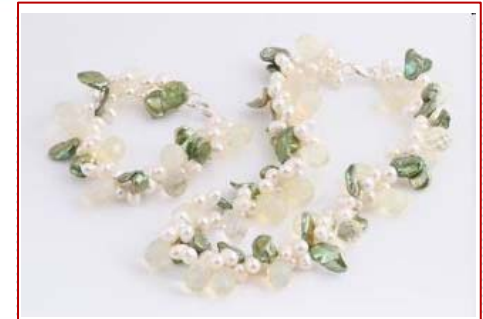
pnset597 Price: $43.60

925silver pendant earrings set featured 7.5-8mm white bread freshwater pearl combine with sterling silver mounting with zircon beads