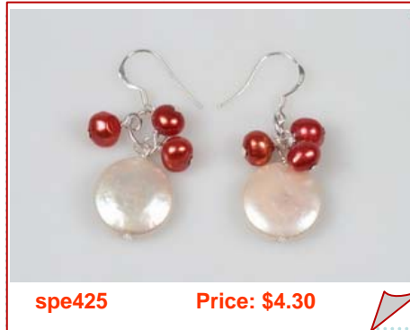
Popular Potato Pearl and Coin Pearl 925Silver Hook Earrings

This stunningly elegant cultured pearl Coral stud earrings, hand wired by sterling silver line, made of 7-8mm white potato pearl and 10mm red coral beads