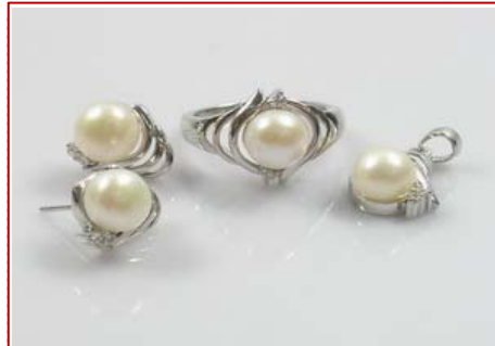
pnset092 Price: $22.50

Fashion pearl jewelry set linked with silk thread, alternated with 5-6mm champagne potato pearl, 9-10 black potato pearl and 6mm smoking quartz