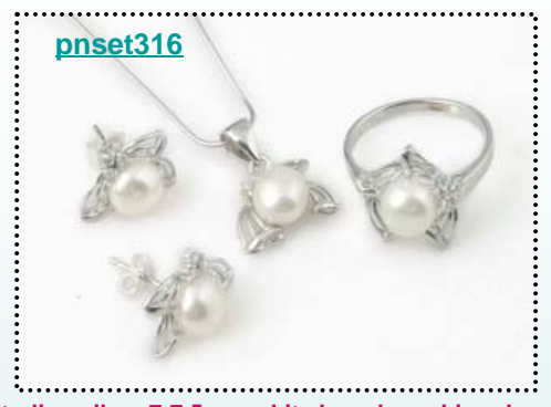
sterling silver 7-7.5mm white bread pearl jewelry set

Elegant sterling silver pearl jewelry set consist of white color 7-7.5mm button pearl combine with 925silver mounting with zircon beads; You also can choose other pearl color as: pink, purple or black;