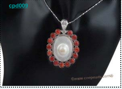
Hand wrapped 45*60mm oval shape red coral pendant

Hand wrapped modern red coral pendant, made of a 25*30mm mother of pearl shell framed with a shiny tray of silver plated,