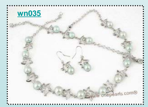
Star pattern CZ valentine's necklace set with blue bread pearl

The 16-inch classic blue pearl necklace, 7-inch blue pearl bracelet and matching blue pearl dangle earrings for pierced ears feature 8-8.5mm blue freshwater bread pearl set