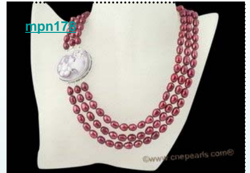
6.5-7.5mm wine red freshwater rice pearl necklace in triple strand

Wear this fun and flexible necklace for every occasion! This cultured pearl necklace is created from 6.5-7.5mm wine red freshwater rice pearl, This necklace carefully hand strung in triple strand, end with a lady clasp Price:$17.3