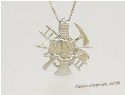
Swpm064 Price: $7.90