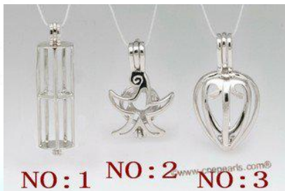
Swpm105 Price: $7.70

Wholesales 925 Silver wish pearl cage pendants, love pearl cages pendant, In addition you can order our oyster pearls with round pearl in cans to make wish pearl necklace