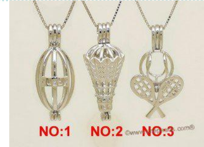
Swpm055 Price: $6.70

Wholesales sterling Silver wish pearl cage in camera Design, love pearl cages pendant. You also can order our oyster pearls with round pearl in cans to make wish pearl pendant necklace.