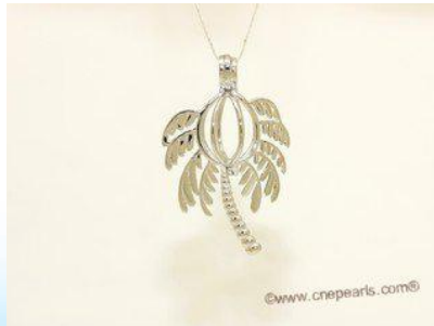
Swpm043 Price: $7.90

Wholesales Sterling Silver wish pearl cages at discount price, can combine them with oyster pearls in cans to make wish pearl necklace jewelry set.