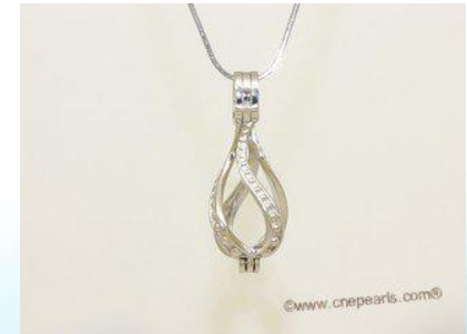
Swpm042 Price: $7.20

Wholesales sterling Silver wish pearl cage in Palm tree design, love pearl cages pendant. You also can order our oyster pearls with round pearl in cans to make wish pearl pendant necklace