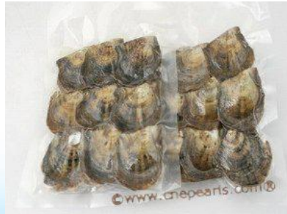
oyster03 Price: $471.60

We packed 4*30pcs bulk akoya oysters by vacuum-packed without liquid in one carton, it can save much shipping cost from the new packing, the total 120pcs oyster are planted in AA grade round pearls Good luster in mix size and mix color