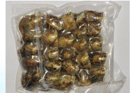
oyster09 Price: $333.50

We packed single bulk akoya oysters by vacuum-packed without liquid in one carton, it can save much shipping cost from the new packing, A real pearl are planted in every oysters, pearl is about 6-7mm, AAA Grade quality