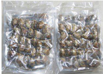
oyster010 Price: $241.50

We packed single bulk akoya oysters by vacuum-packed without liquid in one carton, it can save much shipping cost from the new packing, A real pearl are planted in every oysters, pearl is about 6-7mm, AA quality ;