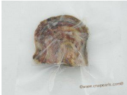
oyster011 Price: $241.50