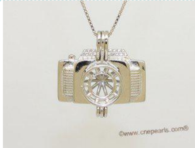
Swpm067 Price: $9.50

Wholesales sterling Silver wish pearl cage in Firefighter Tools Design, love pearl cages pendant. You also can order our oyster pearls with round pearl in cans to make wish pearl pendant necklace