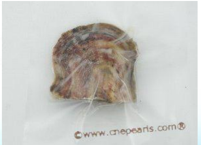
oyster07 Price: $181.20

We packed 120pcs single packed bulk akoya oysters by vacuum-packed without liquid in one carton, it can save much shipping cost from the new packing, the total 120pcs oyster are planted in AA grade round pearls Good luster in mix size and mix color