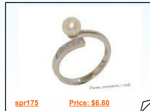
Silver Freshwater Cultured Pearl & Zircon Bypass Ring

This ring is made of cube zircon beads and sterling silver, the cocktail ring beautifully handcrafted in sterling silver with two bold crossed balls, one of 8-9mm tear-drop pearl and the other sterling silver with embedded CZ's