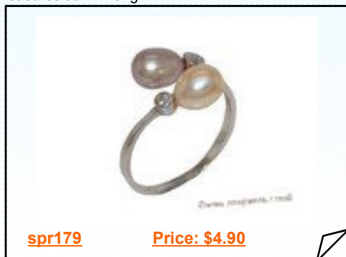
Sterling Silver Bypass Ring with Freshwater Pink & Purple Pearls

The ring is made of sterling silver and the sterling silver heart is embellished with cubic zirconia. a 7-8mm round freshwater pearl is set in the center. It is a great anniversary present!