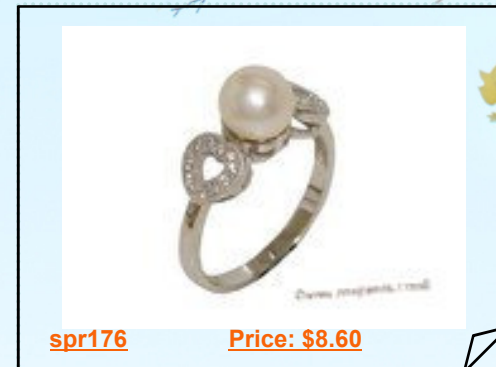
Sterling Silver Freshwater Cultured Pearl & Zircon Accent Heart Ring

Sterling silver ring featuring a 6.5-7mm freshwater pearl centerpiece, flanked by small zircon beads paved love knots. The ring is crafted of gleaming sterling silver with a highly polished finish