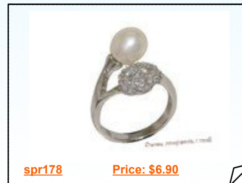
Sterling Silver Freshwater Cultured Pearl & Zircon Accent Twisted Ring

This sterling silver ring features an open bypass design with a freshwater rice pearl at each end of the open shank; each pearl is 6-7mm in diameter, one pearl in pink color, and one pearl in purple color.