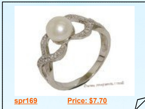
Fine 925 Sterling Silver Finger Band Love Knot Pearl Ring

Pretty sterling silver multi pearl and zircon ring. There are 5 freshwater cultured bread pearls each measures 5.5-6mm. the pearls are in the beautiful white color, good luster. the ring is a size 7, the top of the ring measures 35mm long.