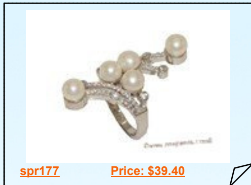
Sterling Silver White Pearl and Zircon Accent Ring

Pretty sterling silver multi pearl and zircon ring. There are 5 freshwater cultured bread pearls each measures 5.5-6mm. the pearls are in the beautiful white color, good luster. the ring is a size 7, the top of the ring measures 35mm long.