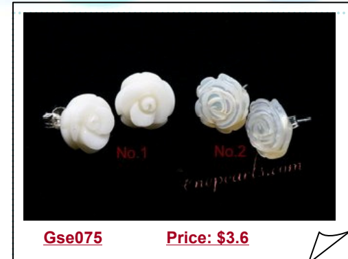
White Coral Carved Flower Sterling Silver Stud Earrings

Chic colorful gemstone pendant features nearly eighty Colorful SWAROVSKI GEMSTONES beautifully crafted in an Mango design of sterling silver.