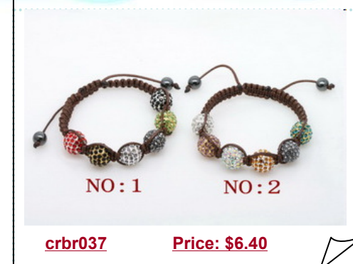
Different color crystal ball bead bracelet knotted with cord thread

This crystal ball bead bracelet knotted with cord thread, 7.5"-10" in length. 3 crystal ball bead are connect by the coffee color cord thread