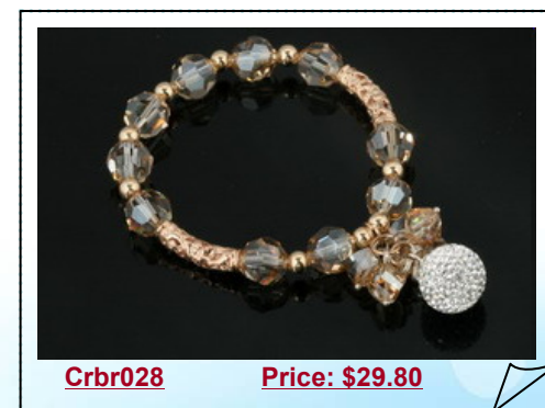
Handmade Faceted Austria Crystal Stretchy Bracelet

This simple Tungsten Steel Stone bracelet knotted with cord thread, 7.5"-10" in length.