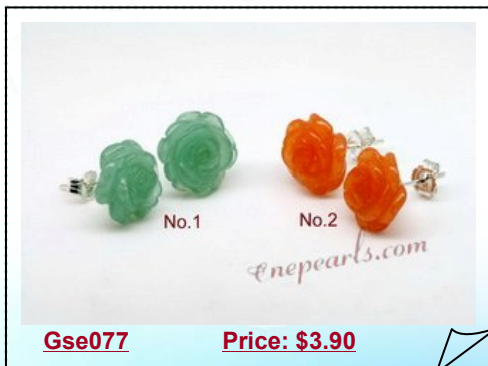
Fine Jade & Agate Carving Flower Sterling Silver Stud Earrings

Intricate carving and lustrous shine make these coral flower earrings dazzling. Stud backs make them versatile. These graceful earrings are shimmering white Coral/mother-of-pearl