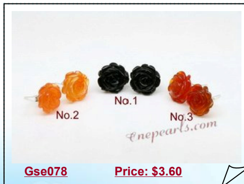
Hand carved Rose Flower Carve Agate Stud Earring Wholesale

The studs are made of 925 sterling silver. The jade flower measures approx 12mm in diameter of delicacy carved and has beautiful color.