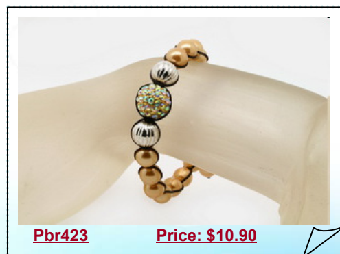
Unusual Crystal Ball Bead and Shell Pearl Cord Bracelet

This crystal ball bead bracelet knotted with cord thread, 7.5"-10" in length. 6 different color crystal ball bead are connect by the coffee color cord thread