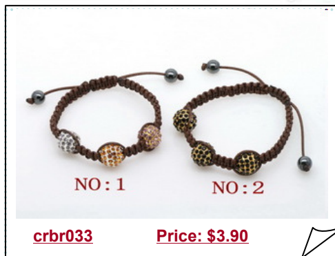
Designer crystal ball bead bracelet knotted with cord thread

This crystal ball bead bracelet knotted with cord thread, 7.5"-10" in length. 6 crystal ball bead are connect by the coffee color cord thread, this piece will go with anything.