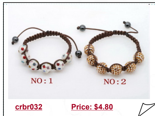
Designer crystal ball bead bracelet knotted with cord thread

This crystal ball bead bracelet knotted with cord thread, 7.5"-10" in length. 6 crystal ball bead are connect by the coffee color cord thread, this piece will go with anything.