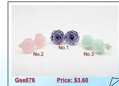
Pretty Carved Flower Gemstone Sterling Silver Stud Earrings

Hand crafted agate stud earrings made of 12mm rose flower carve agate beads combine with 925 sterling silver stud