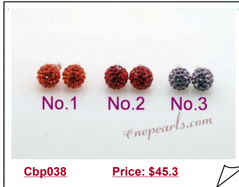
Chic Colorful Gemstone Sterling Silver Mango Pendant

Our beautiful shamballa crystal stud earrings, suitable for any occasion, stylish Shamballa stud earrings are individually hand crafted from 10mm round crystals beads