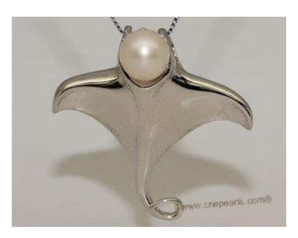
Spp394 Price: $16.90

925 sterling silver sting ray pearl pendant sea life charm