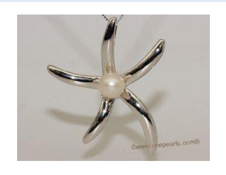
<u>spp411</u> <u>Price: $15.20</u>

Timeless freshwater pearl pendant features a simple pendant combine with an 6-7mm purple freshwater round pearl;